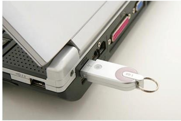
Infected memory stick caused virus to spread rapidly, forcing council to cut internet and phone links to preserve core systems

A computer virus crippled a London council for weeks after a worker accidentally plugged an infected memory stick into a computer.